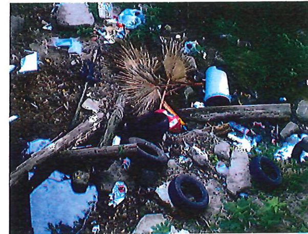
Cedar Creek on Old Navasota Rd.

Taxpayers pay the cost of cleaning up dumps on public lands and right-of-ways.